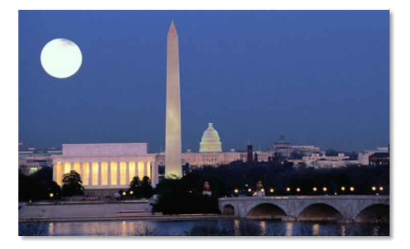
Enjoy Your Say in the Washington, D.C. Area!