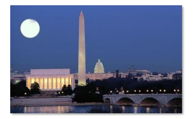
Enjoy Your Say in Washington, D.C.!